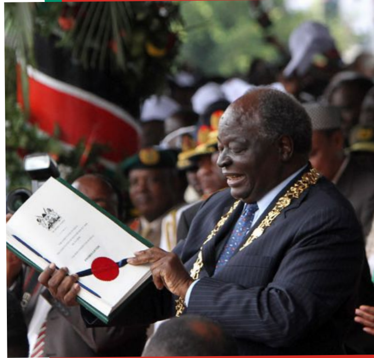
Kenya's President Mwai Kibaki displays the Oath of Due Execution during the promulgation of the New Constitution, Uhuru Park, Nairobi, 27 August 2010

The regime partially repealed the infamous Chiefs' Act , which gifted local administrative chiefs unfettered powers to stop meetings. The regime also repealed sections of the Public Order Act, such as the requirement for organisers of protests or demonstrations to obtain permits instead of simply providing written notification to the police before holding an assembly. Despite these reforms, disruptions of public protests and private CSO meetings continued.